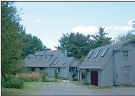
Detached 3-car garage with shop area and guest apartment. Room for a pool